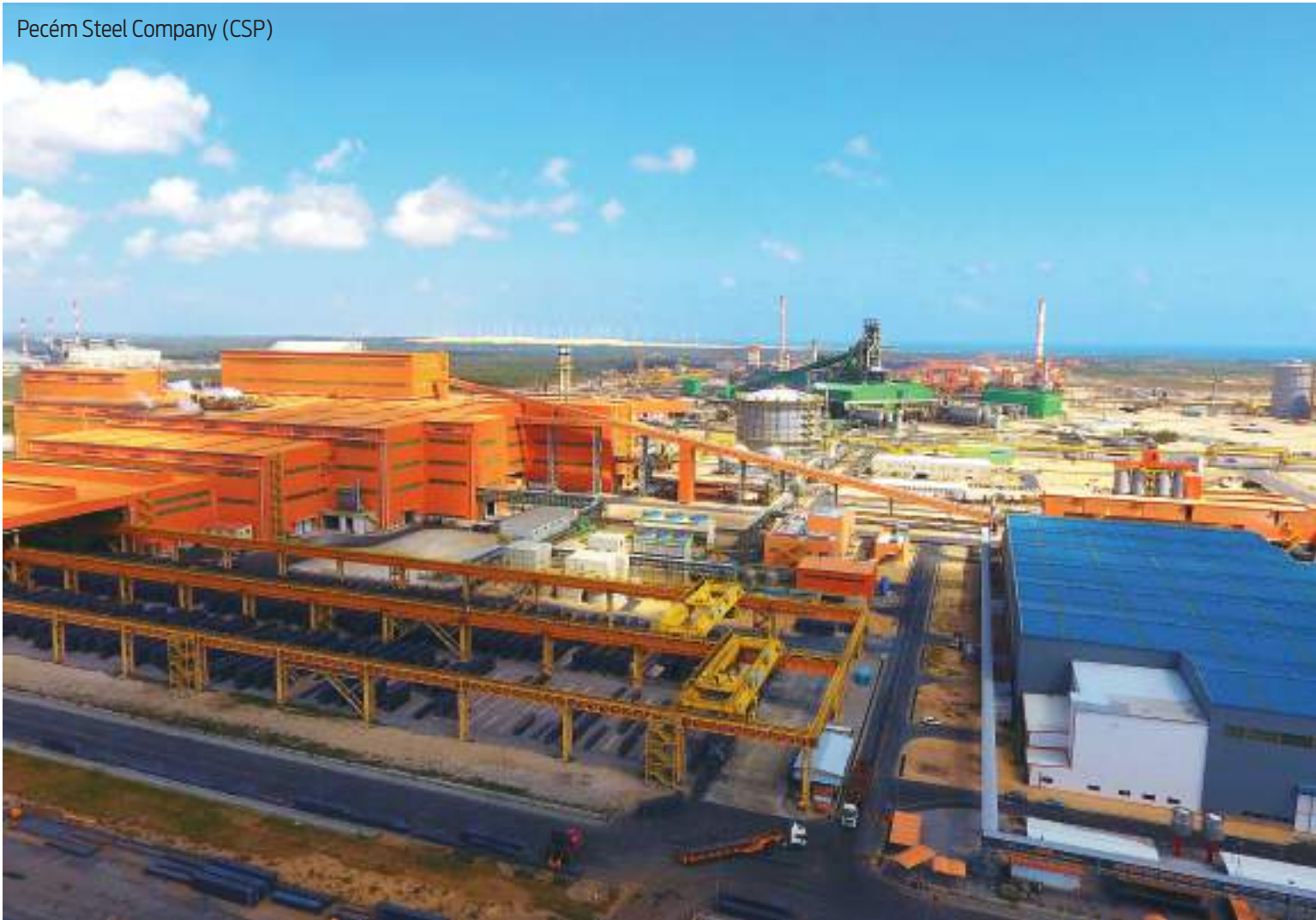
Pecém Steel Company (CSP)