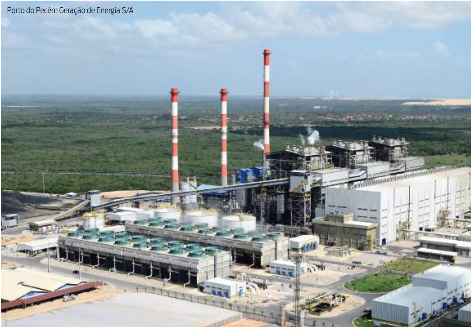
Porto do Pecém Geração de Energia S/A