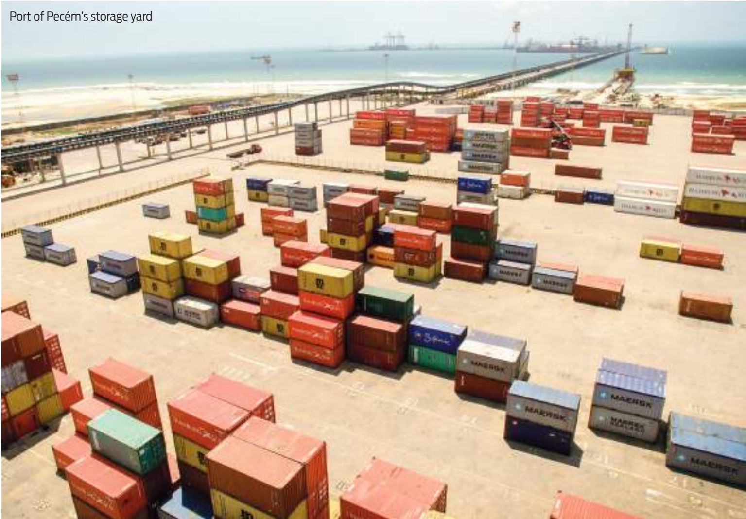
Port of Pecém's storage yard