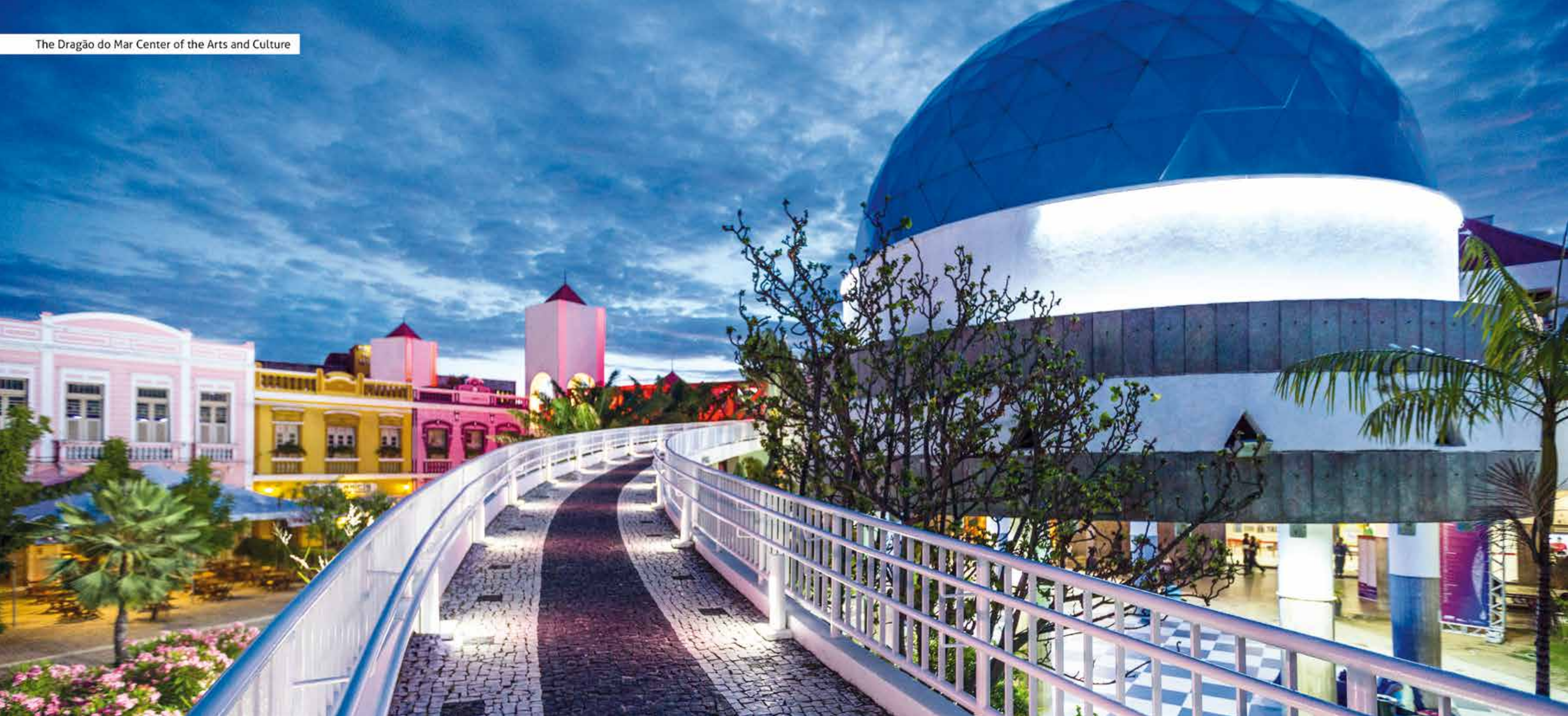
The Dragão do Mar Center of the Arts and Culture