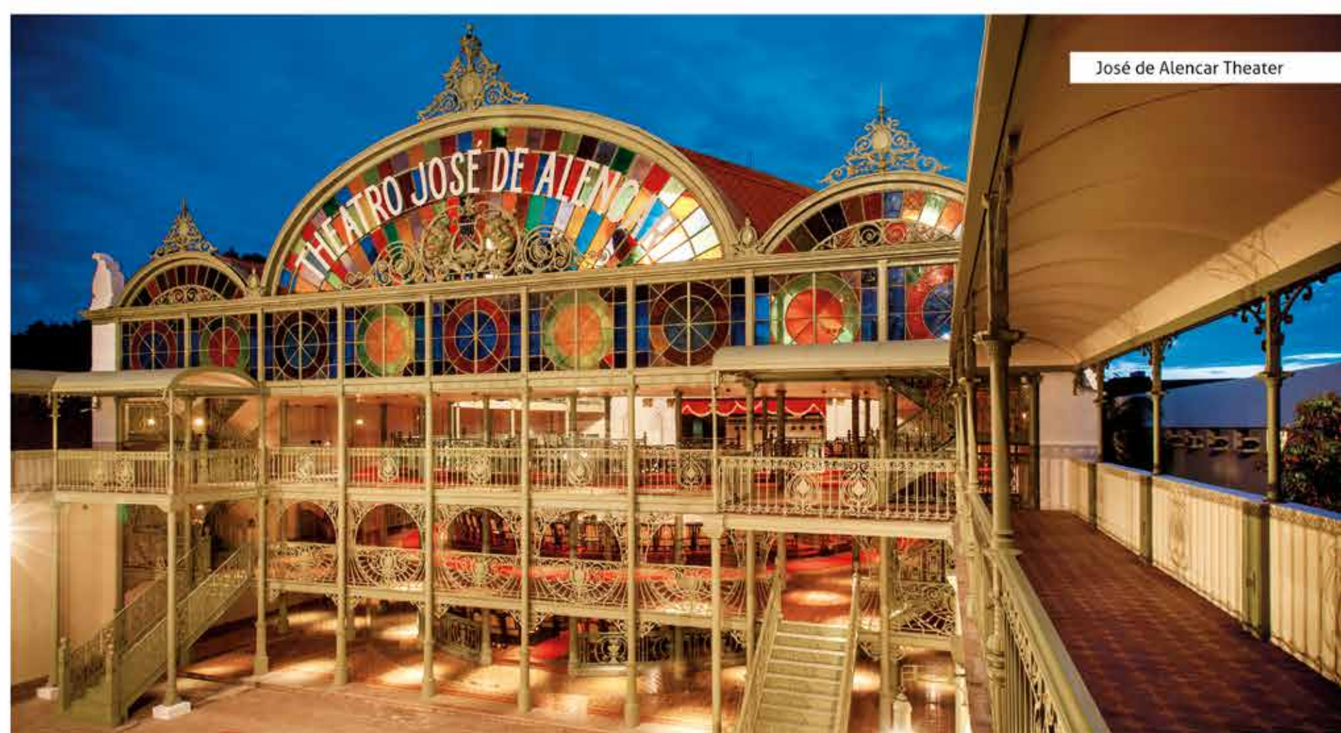
José de Alencar Theater

Art, music, history. We have much to tell.