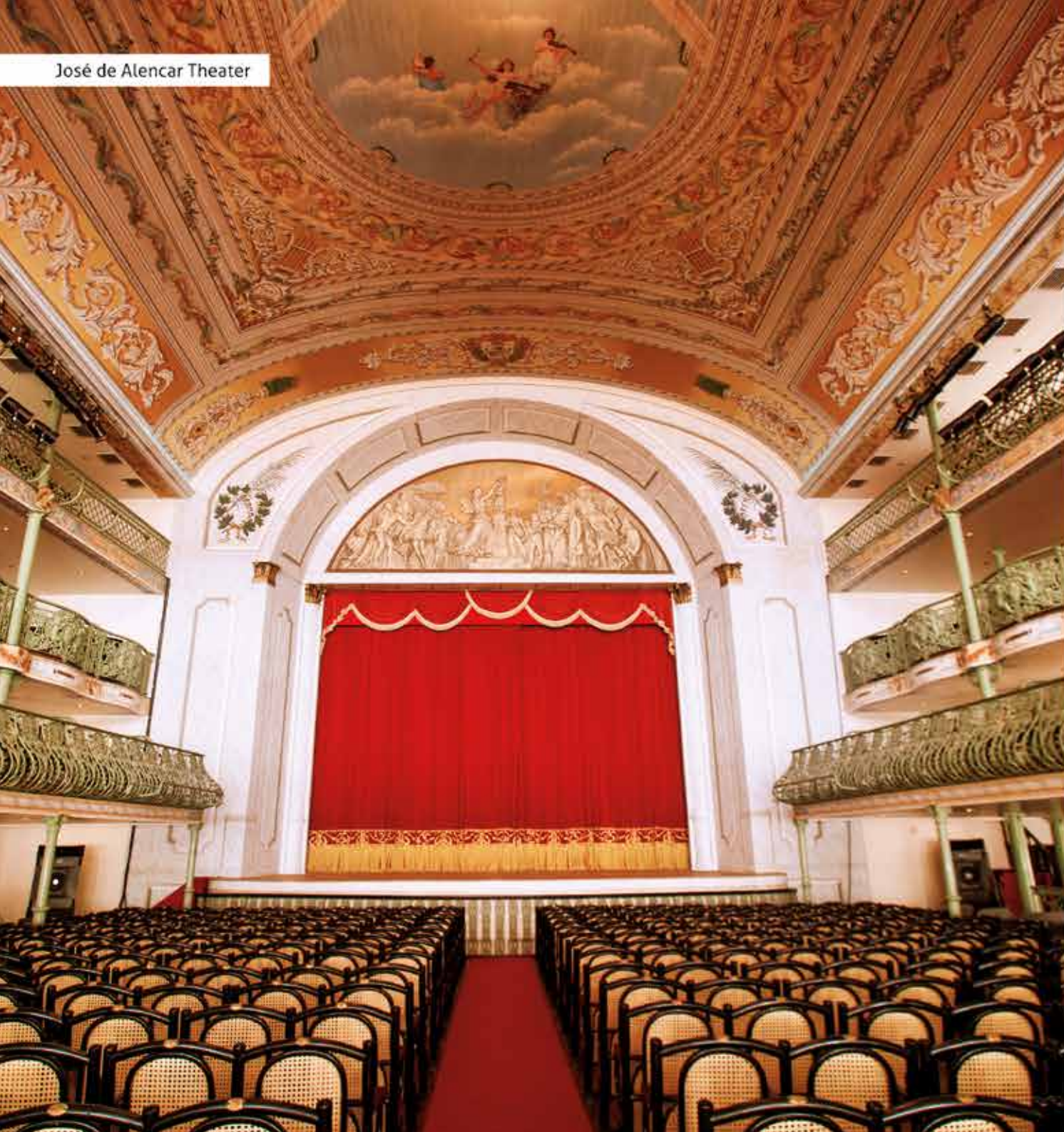
José de Alencar Theater