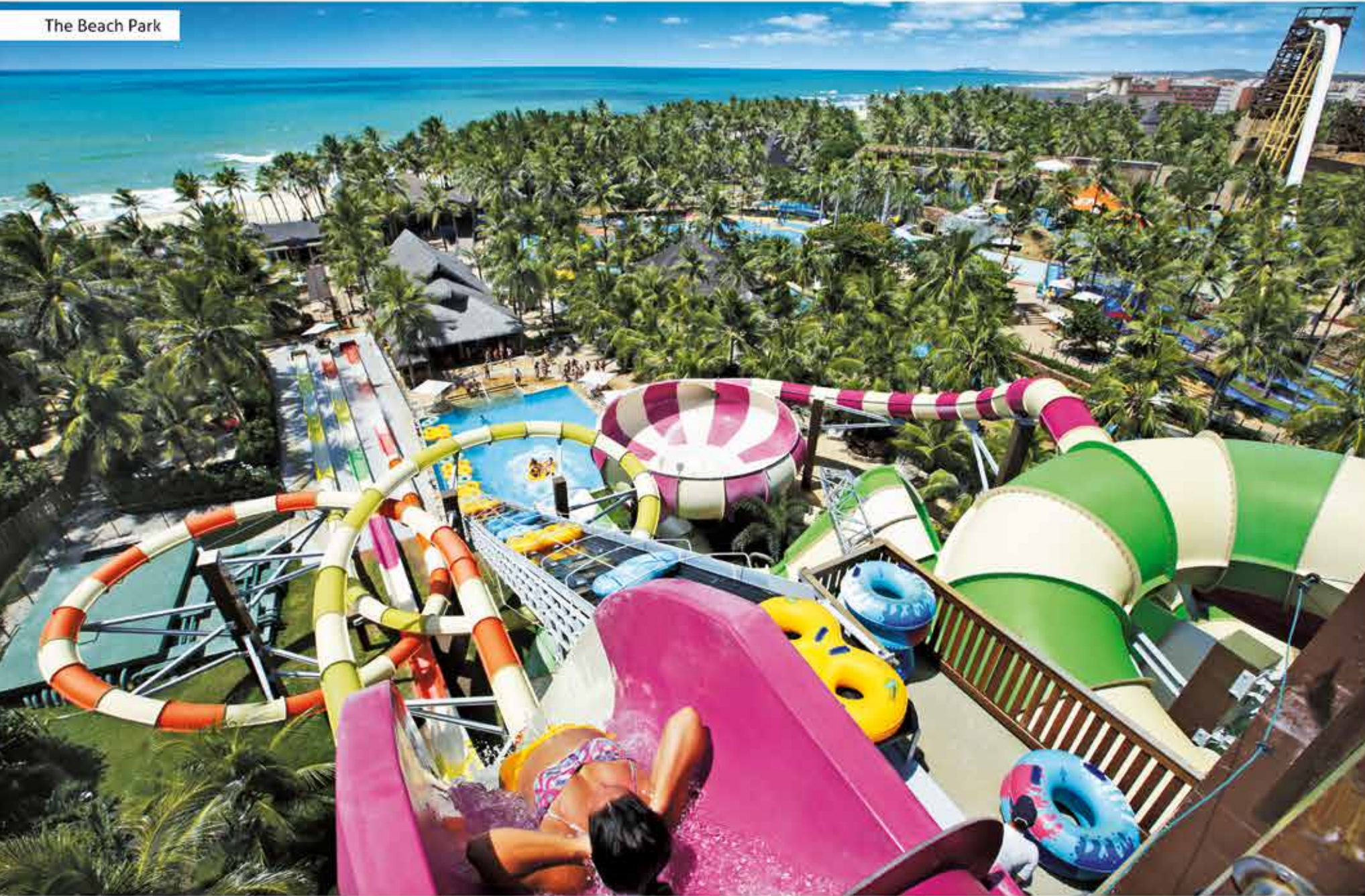
The Beach Park