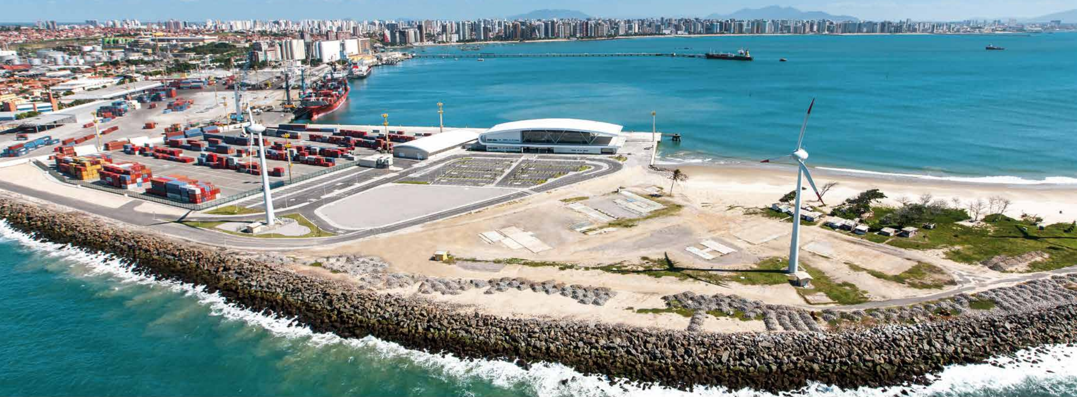
Mucuripe Passenger Ship Terminal